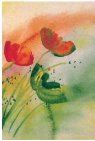
Kortzau Flowers 3