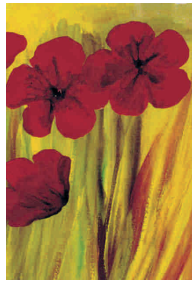
Kortzau Flowers 2