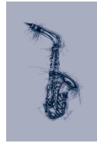
Penny Warden Sax Blue