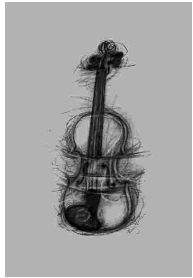
Penny Warden Violin

Penny has been influenced by action painting and gestural abstraction. She applies oil paint or charcoal with maximum of spontaneity.