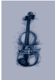
Penny Warden Blue Violin