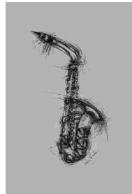
Penny Warden Sax