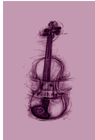
Penny Warden Rouge Violin