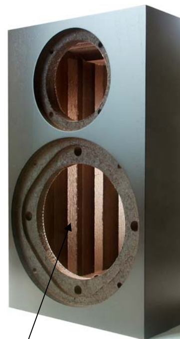
Diffusors They break the sound waves to avoid any echoing inside the cabinet. These do not affect all micro information.

No screw is seen from the outside on the front panel as the drivers are held from the inside. The outer aluminium ring allows a very tight and homogenous fixing of the basket. It facilitates the flow of unwanted vibrations and its curved profile limits the creation of reflections on the outer rim of the basket.